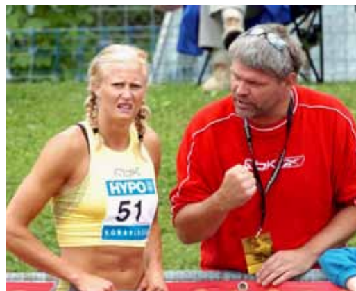
Carolina Klüft and Agne Bergvall.

It is therefore only natural that Arenastaden is in the process of developing into an even more important centre for national and international sport – both in terms of conditions radically improving with new arenas and stadiums and more and more international coaches and active athletes finding their way to Växjö. Arenastaden, with its central location in Växjö is a sporting area and complex with a tremendous power of attraction.