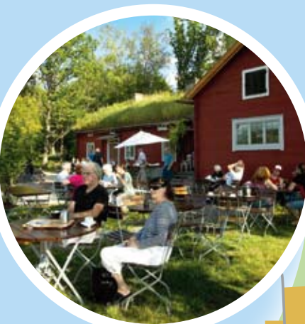
Ryttmästargården by Kronoberg Castle ruins