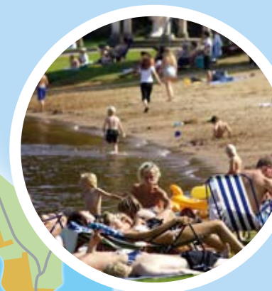
Evedal bathing area Toftasjön lake