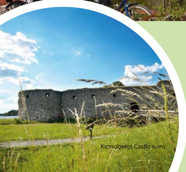
Kronoberg Castle ruins

Whether you choose to walk or go by bike, we wish you a warm welcome to this trail around Europe's greenest city. We promise you a fantastic experience that will give your health a boost and help preserve the environment!