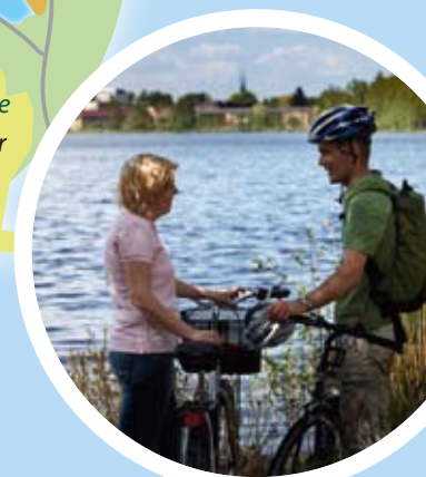
Taking a break by Trummen lake